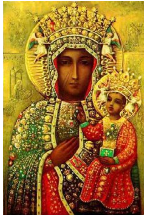
Our Lady of Czestochowa

founded: THE INCARNATION, THE REDEMPTION, AND THE GLORY OF THE RESURRECTION! All of Christian life indeed is bathed in the light of these three realities bound by the person and reality of Jesus Christ. Yet none of these realities could be possible without the one word which changed the course of history: " Fiat mihi secundim verbum tuum – Let is be done unto me according to you word."